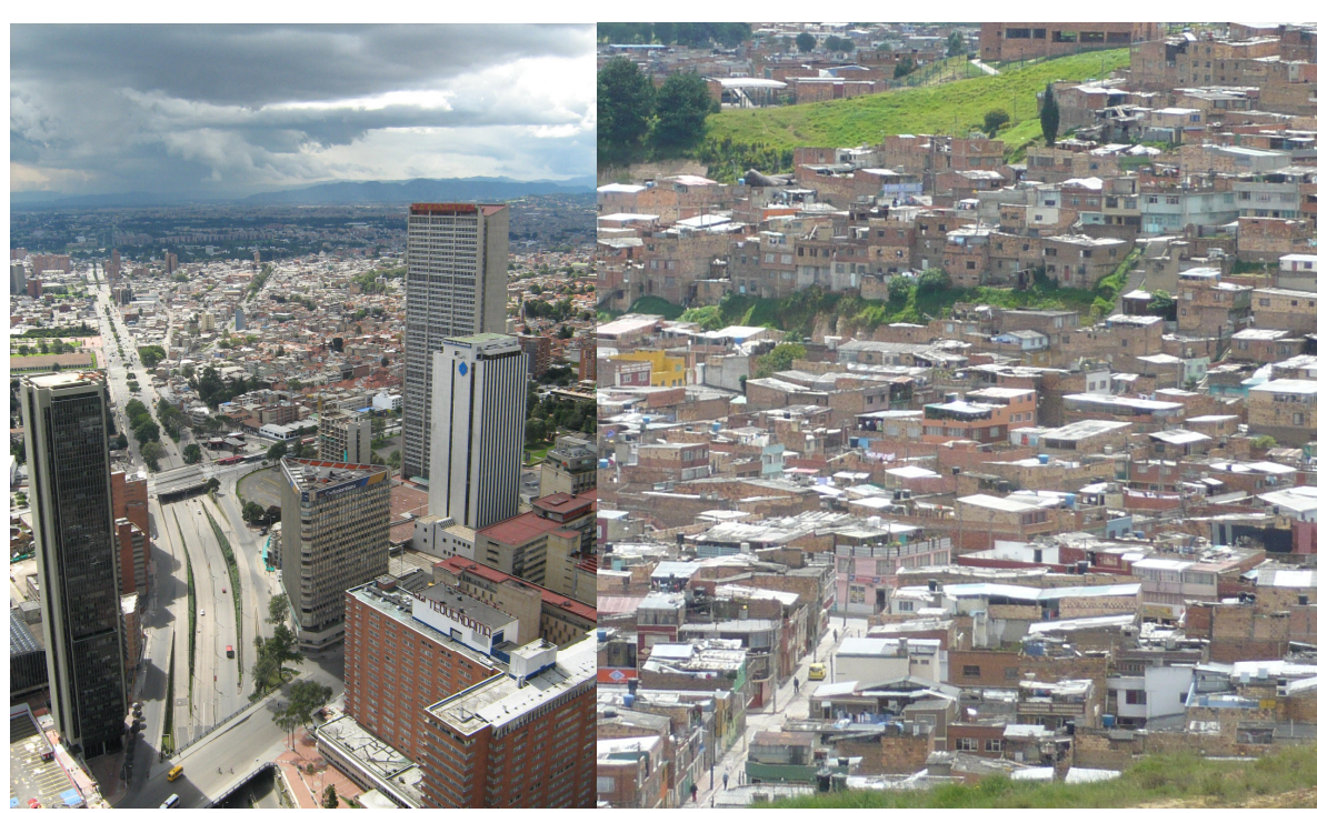
View of formal and informal part of Bogota.

This segregation is also reflected in the distribution of services, infrastructure and environmental quality, that highlight a formal and rich North and a mainly informal and pour South.